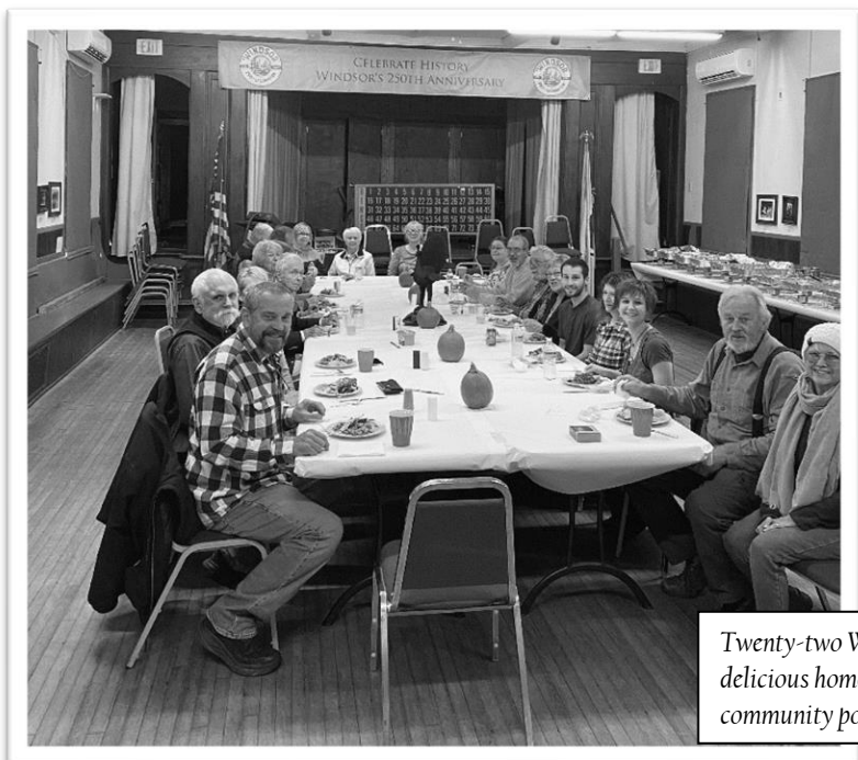
Twenty-two Windsor residents enjoyed friendship and delicious homemade dishes at this year's Thanksgiving Day community potluck at the Town Hall.