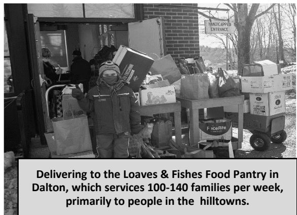
Delivering to the Loaves & Fishes Food Pantry in Dalton, which services 100-140 families per week, primarily to people in the hilltowns.