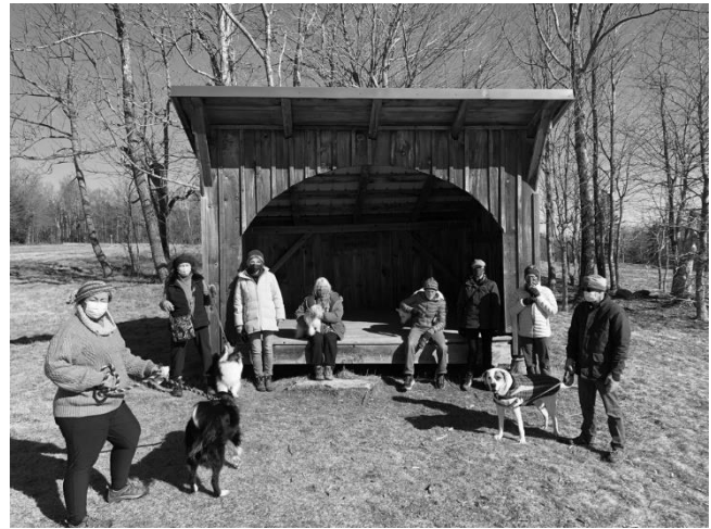
Saturday morning walkers taking a break at Notchview, halfway through our walk.