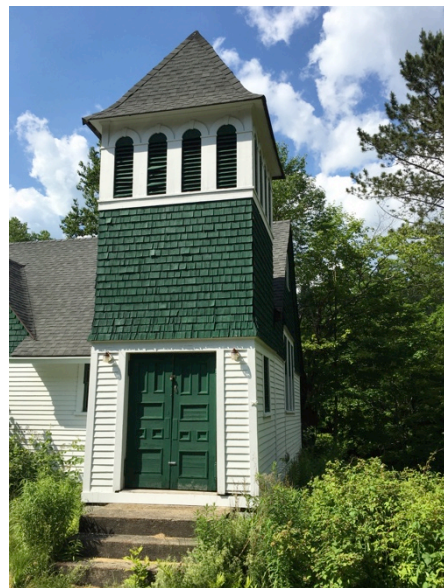
East Windsor Chapel