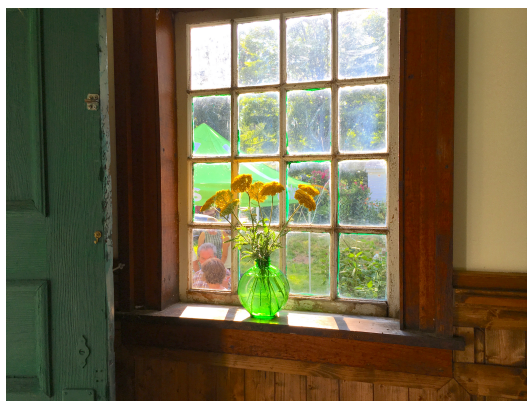
Afternoon light in the chapel

And sincere thanks to the Central Berkshire Fund of Berkshire Taconic Community Foundation and the Windsor Cultural Council for supporting this event.