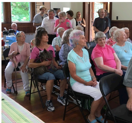
A good crowd filled the chapel